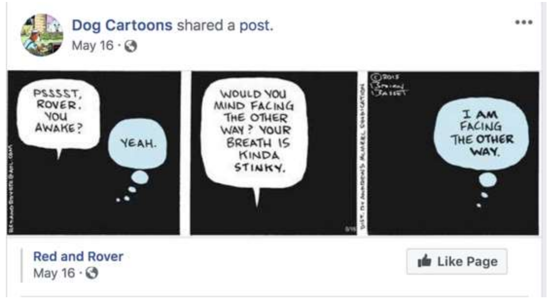
RED AND ROVER FACEBOOK LINK: